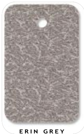
ERIN GREY 022