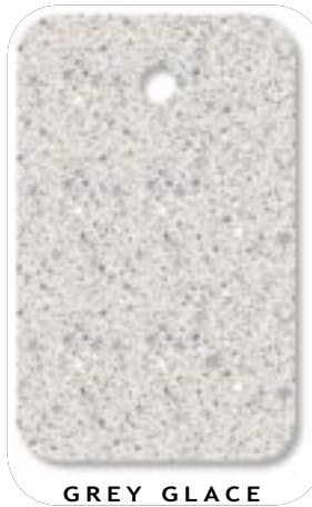
GREY GLACE 025