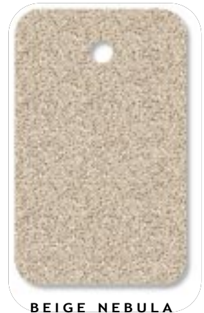
BEIGE NEBULA 087