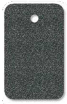
GRAPHITE NEBULA 030