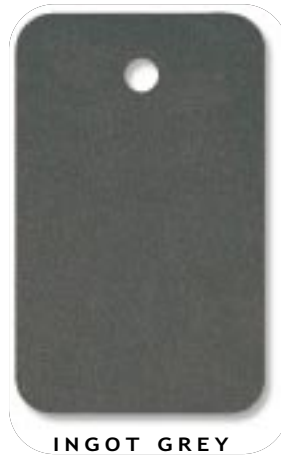
INGOT GREY 006