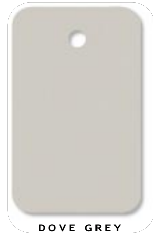
DOVE GREY 002