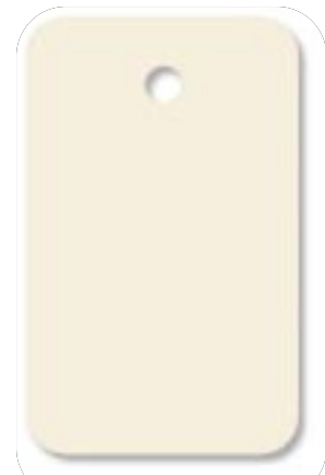
NATURAL ALMOND 050